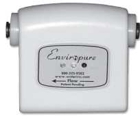
Two AA alkaline batteries are included.