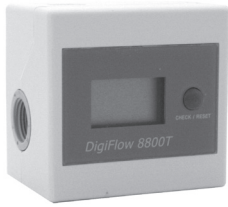
Two AAA alkaline batteries are included.

Installations must comply with appropriate plumbing codes. Do not use vinyl tubing to connect any Water, Inc. Product to a water source. Polyethylene tubing is recommended for cold water applications.