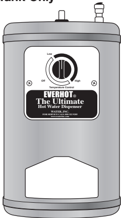
Stainless Steel Shell

Dimensions: Width: 7 3/4" Height: 13" Depth: 9"